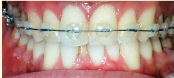
Tooth coloured brace

Fixed braces are available in tooth coloured varieties that blend in with the natural colour of teeth. The wires used to straighten teeth can also be coated with a tooth coloured material to make them less visible. Some tooth coloured braces are not placed on the bottom teeth as they can cause wear to the top teeth.