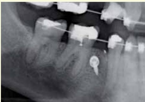
An X-ray showing a mini-screw placed between the lower teeth