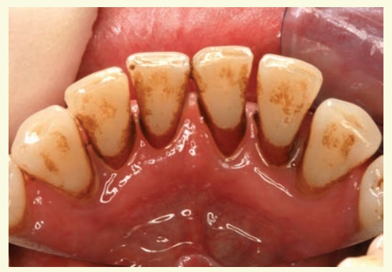
Tobacco staining on teeth